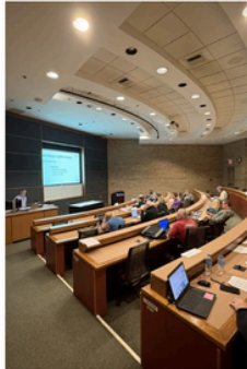
7-hour USPAP and 2-hour Michigan Law Grand Rapids